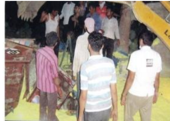
Bharuch District : June 2011 : Polytrauma due to truck overturn