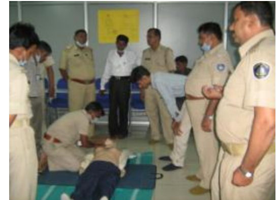
First responder Training -Police Personnel