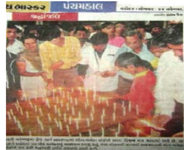
Awareness activity in all districts