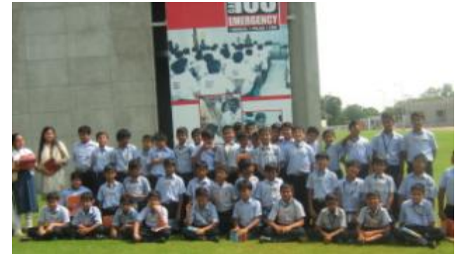
School Visit and interactions