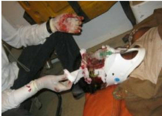
Kutch District : April 2011 : Head Injury victim of two wheeler crash