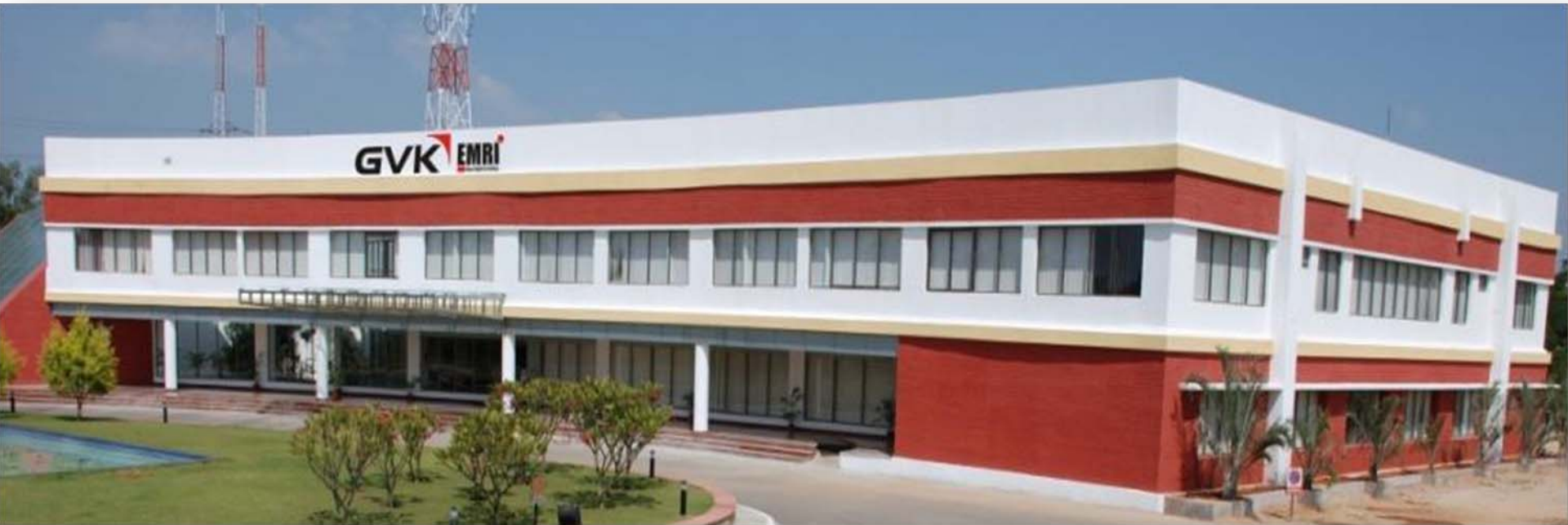
GVK EMRI Head Office, Hyderabad, AP