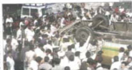
Vehicle Was On Way To Mansa When It Was Hit By A Truck; 10 Injured

CALL 108 EMERGENCY • MEDICAL • POLICE • FIRE